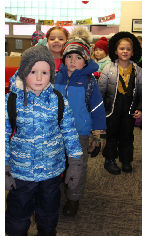
4K heading out for the weekend!

Please reach out with any question you may have.