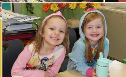
Kindergarten had pajama day!